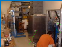
Fig 1. Left image: superconducting gravimeter, its electronics and user interface computer (within one enclosure), refrigerator and UPS (within another enclosure), and hand-lift in lab.