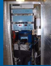
Figure 1 Bottom row of images shows our superconducting gravimeter (SG) system. The gravimeter and associated instruments are contained within two enclosures, which have cooling systems and waterproof aluminum boxes. The hand-lift helps to transport and install the system in the field. By making the instrument transportable, one may choose sites where better-defined hydrologic problems can be investigated, and consider tectonic, volcanic, and other applications, such as deep slow earthquakes (Crossley D. et. al., 1999). The lower row of images shows from left to right: Power Supply and 4 Kelvin refrigerator in one enclosure; 35 liter helium dewar containing sensor in the gravimeter enclosure, with instrument rack on right; and right, the instrument rack showing GWR data logger, volt meter, barometer, electronics, and at the right side, the enclosure heating / cooling system.